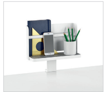
Attached Shelf with Backdrop