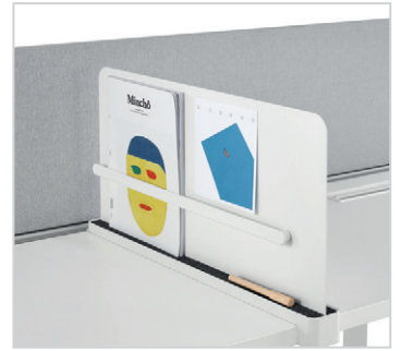
Slim Screen and Document Clip