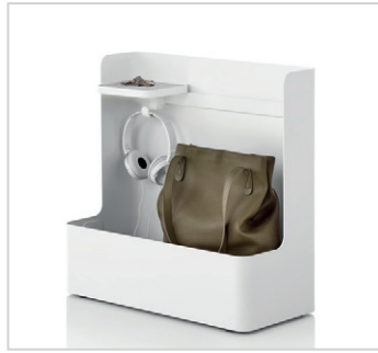
Mobile Bag Catch